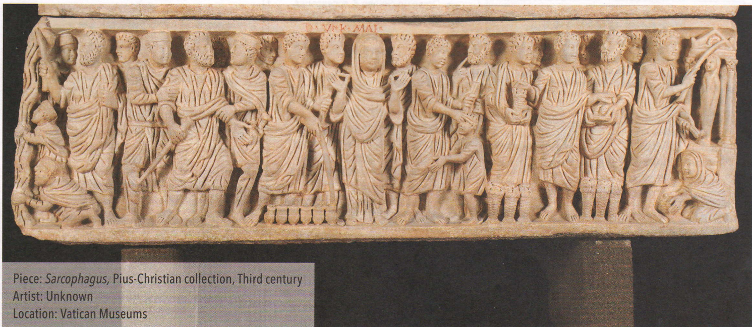
Piece: Sarcophagus, Pius-Christian collection, Third century Artist: Unknown Location: Vatican Museums

Am I generous with my time, treasure, and talent? Do I multiply what I have by giving it to God and others, allowing him to return it to me twelvefold?