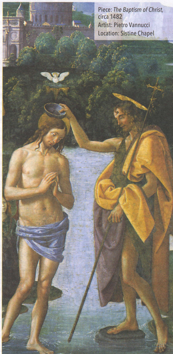
Piece: The Baptism of Christ , circa 1482

How have I benefited from other people who have been generous with their own mission?