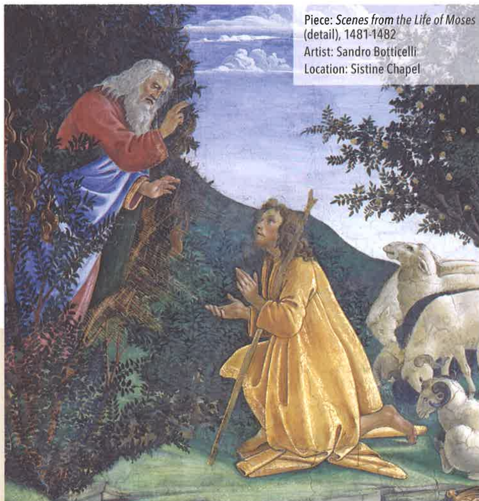
Piece: Scenes from the Life of Moses (detail), 1481-1482