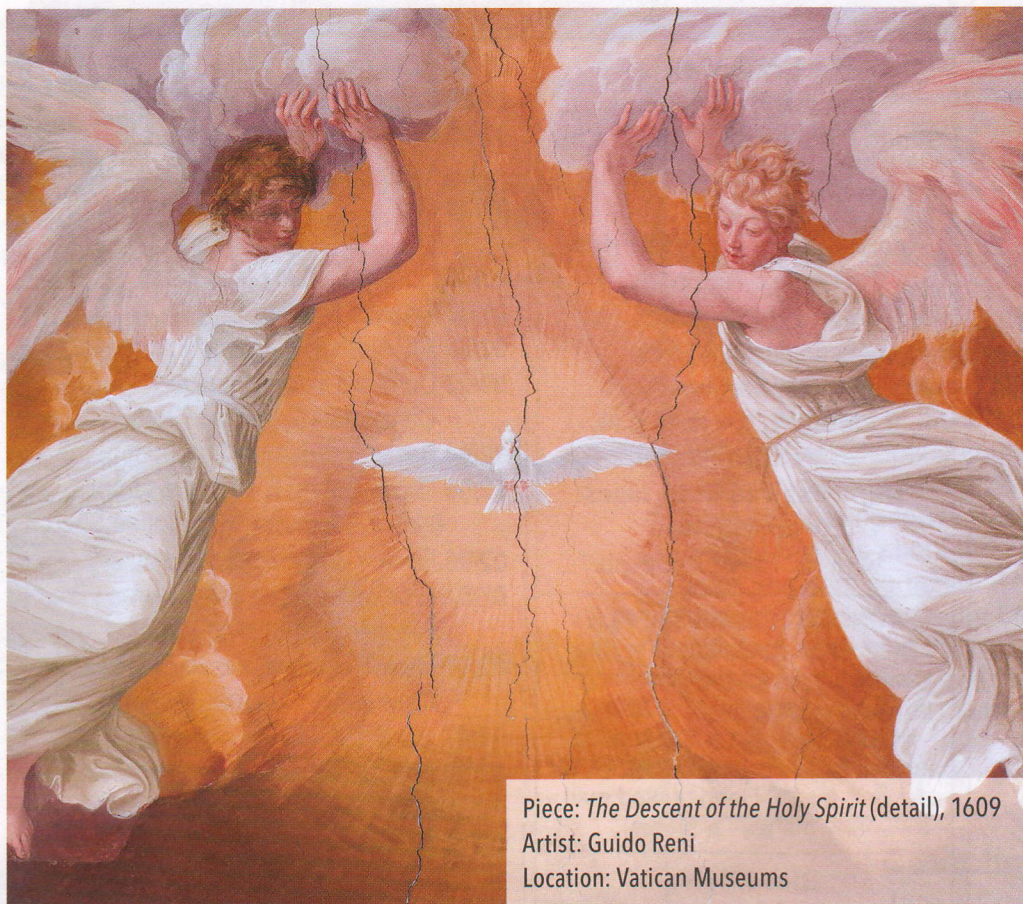
Piece: The Descent of the Holy Spirit (detail), 1609 Artist: Guido Reni Location: Vatican Museums

that had been given to them through Moses hundreds of years before. They were now listening to it for the first time. Upon hearing all its wisdom and prescriptions, they were cut to the heart and wept. There was so much they had forgotten and were no longer practicing. As exiles in Babylon they had lost so much.