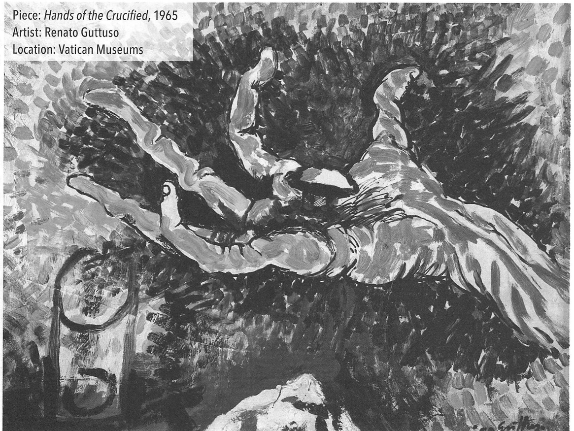
Piece: Hands of the Crucified , 1965 Artist: Renato Guttuso Location: Vatican Museums