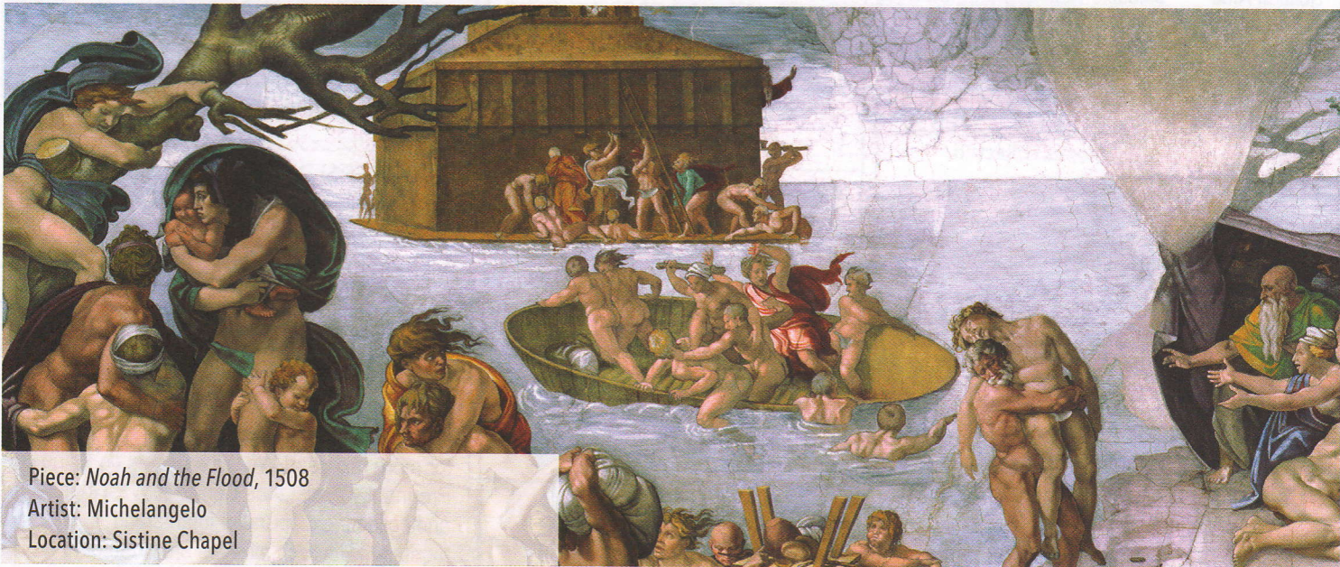
Piece: Noah and the Flood , 1508

What important lessons have I learned from a challenge in my life? Maybe I can share that lesson with a friend or family member.