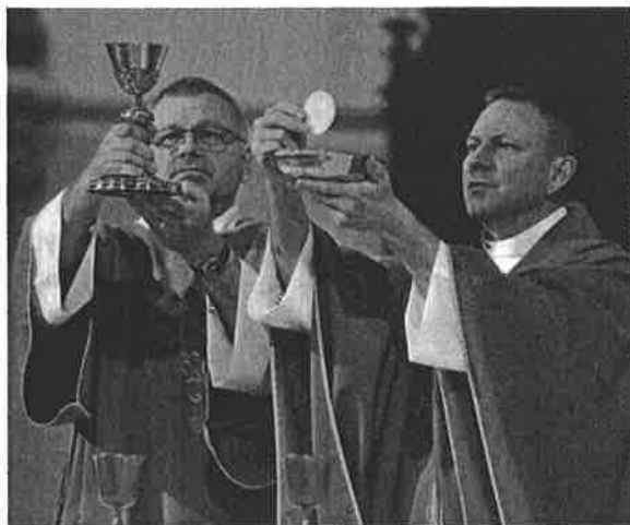
DEACON, AT LEFT

Deacons are vital to the life of the Church. Many permanent deacons have families and full-time jobs in addition to their Church work. We don't thank deacons and their families enough for the many sacrifices they make for the people of God.