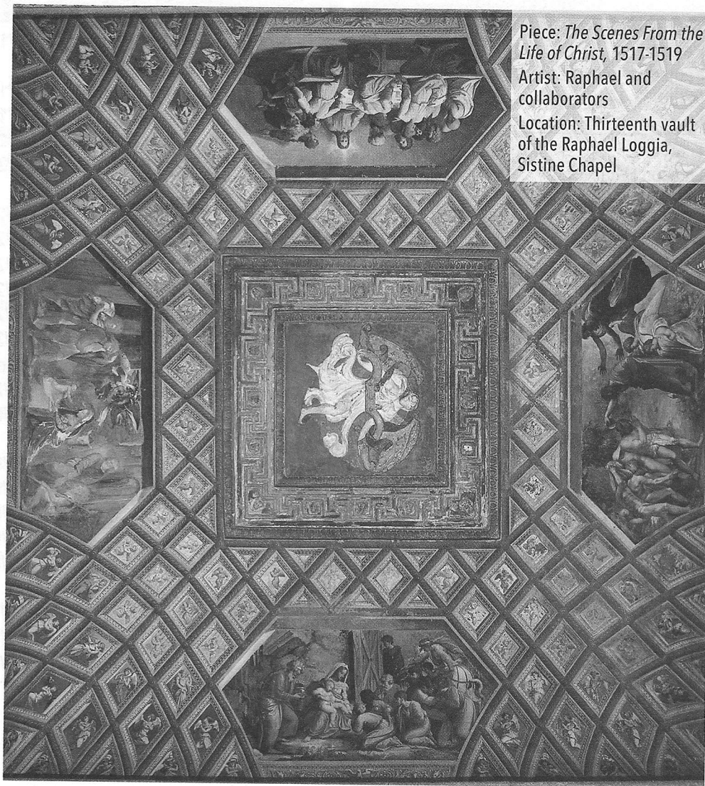
Piece: The Scenes From the Life of Christ , 1517-1519

As a result, like Jesus, we will no longer be ashamed