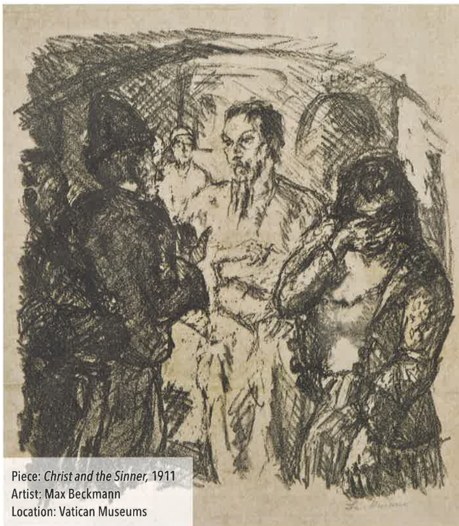
Piece: Christ and the Sinner , 1911 Artist: Max Beckmann Location: Vatican Museums