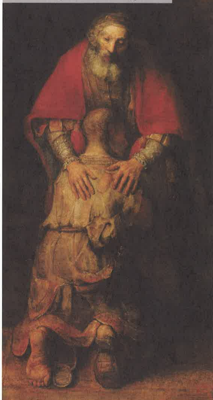
REMBRANDT VAN RIJN/RETURN OF THE PRODIGAL SON

Location: Hermitage Museum, St. Petersburg