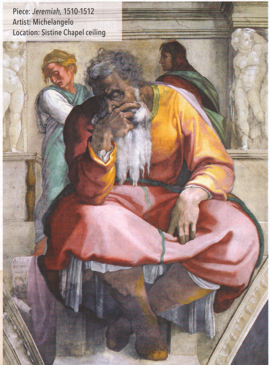
Piece: Jeremiah , 1510-1512