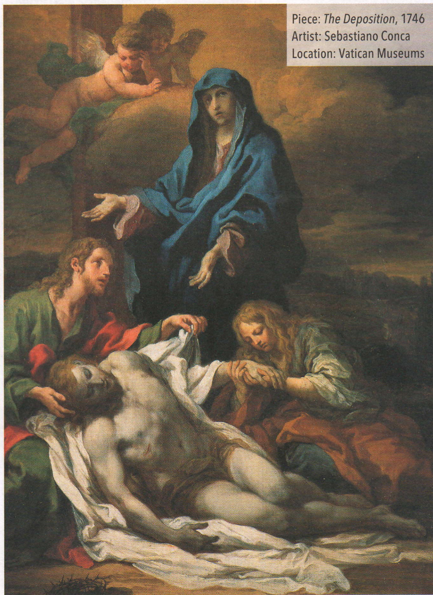
Piece: The Deposition , 1746 Artist: Sebastiano Conca Location: Vatican Museums