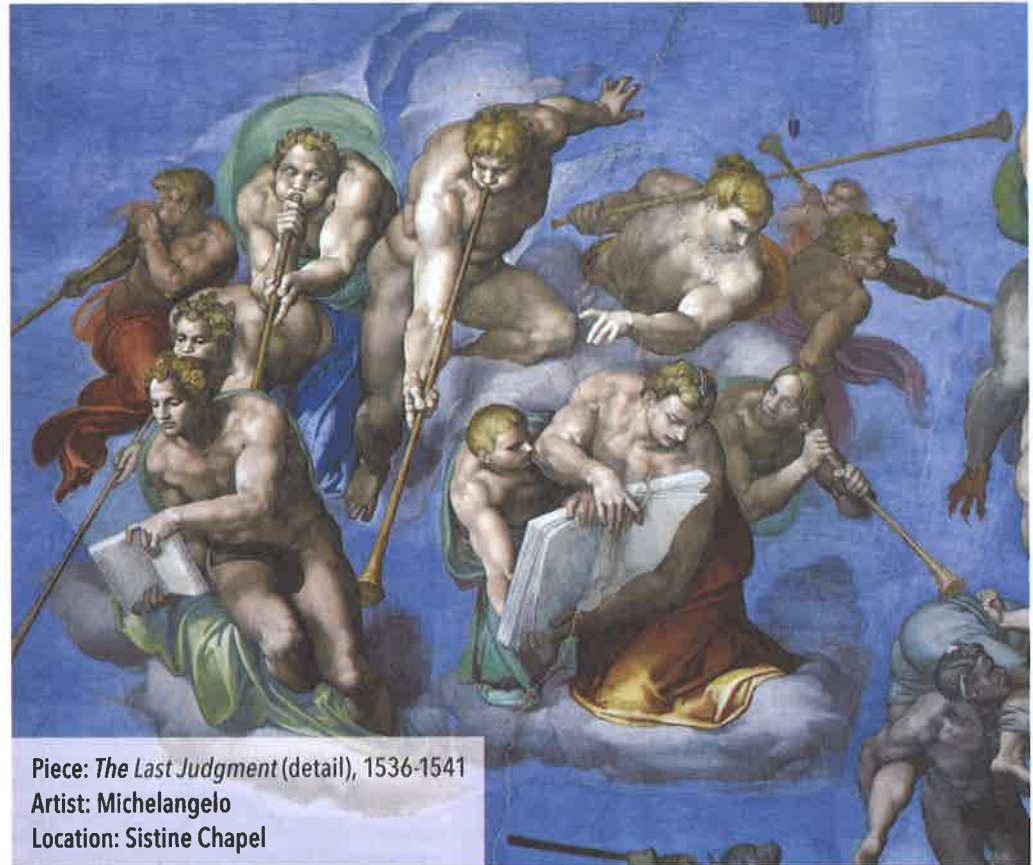
Piece: The Last Judgment (detail), 1536-1541 Artist: Michelangelo Location: Sistine Chapel

The glory of this kingdom isn't in church buildings or organizations, but it's the glory that Jesus mentions in today's Gospel. "Now is the Son of Man glorified, and God is glorified in him" (John 13:31). It's the glory that comes from Jesus' faithful love toward the Father and his disciples, leading him to be enthroned on the cross and rule as the Lamb that was slain yet still