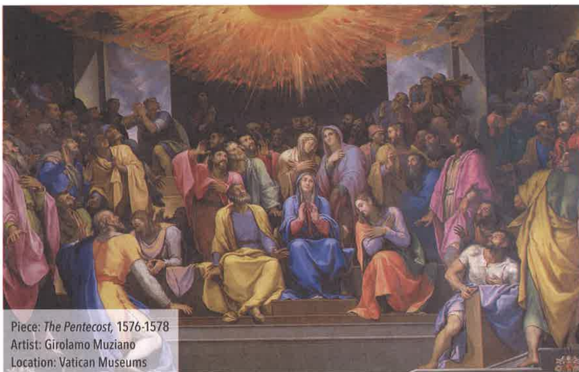
Piece: The Pentecost , 1576-1578

Jesus declared to the apostles at the Last Supper that the Holy Spirit would remind them of all he told them. Jesus gave this gift to the Church, and it's something we should value. How often do we do an internet search about a subject and then trust what a few articles say? Yet, are we as quick to look up what the Holy Father and the bishops say on different subjects in order to be guided by that light?