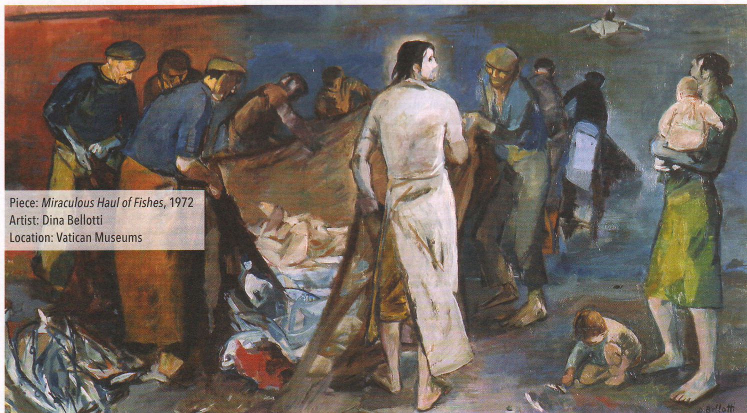
Piece: Miraculous Haul of Fishes , 1972

Do I invest in my work, home, and social responsibilities as a response to the call of Jesus?