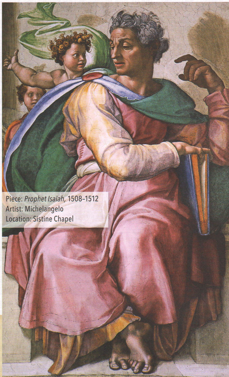
Piece: Prophet Isaiah , 1508-1512