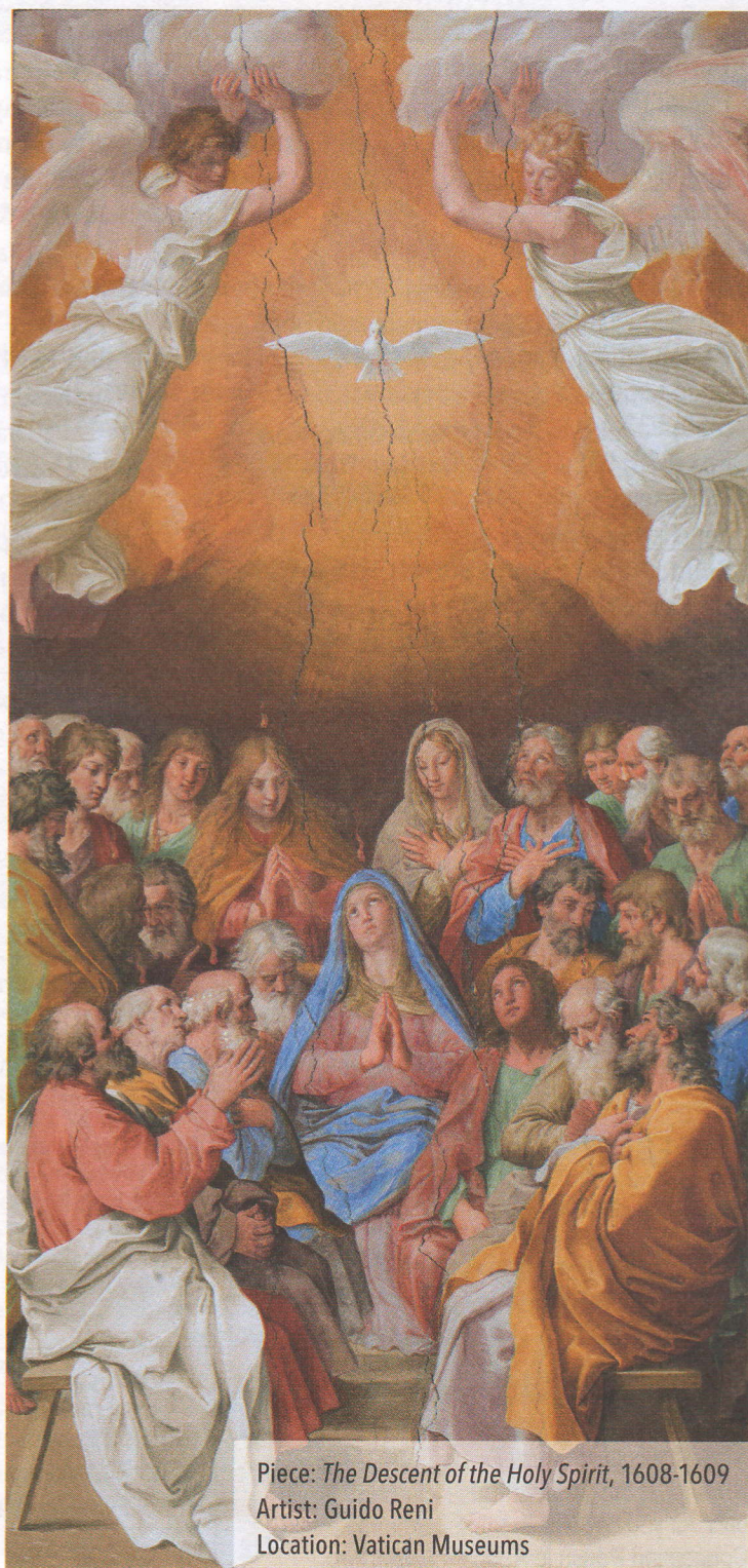
Piece: The Descent of the Holy Spirit , 1608-1609

Patience is a fruit of the Spirit. How can you practice more patience this week?