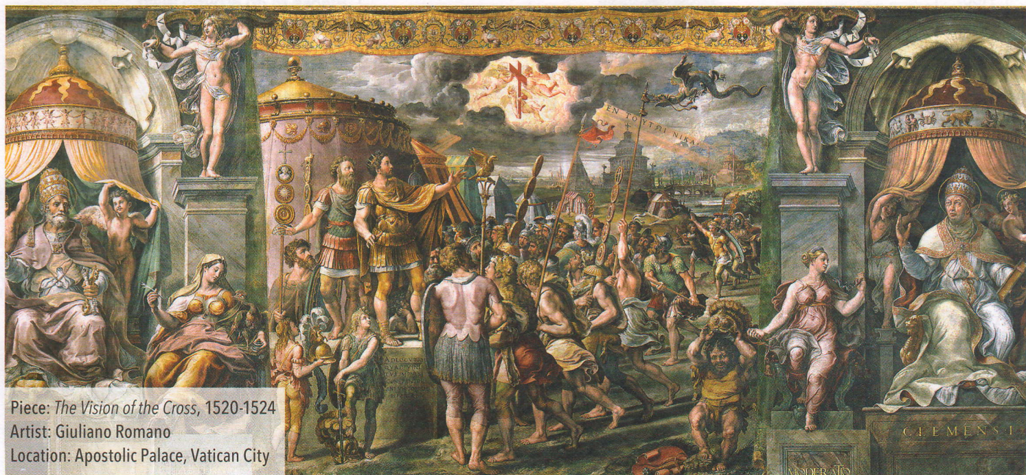
Piece: The Vision of the Cross , 1520-1524