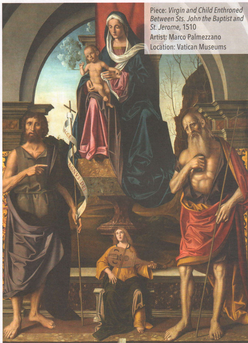
Piece: Virgin and Child Enthroned Between Sts. John the Baptist and St. Jerome , 1510