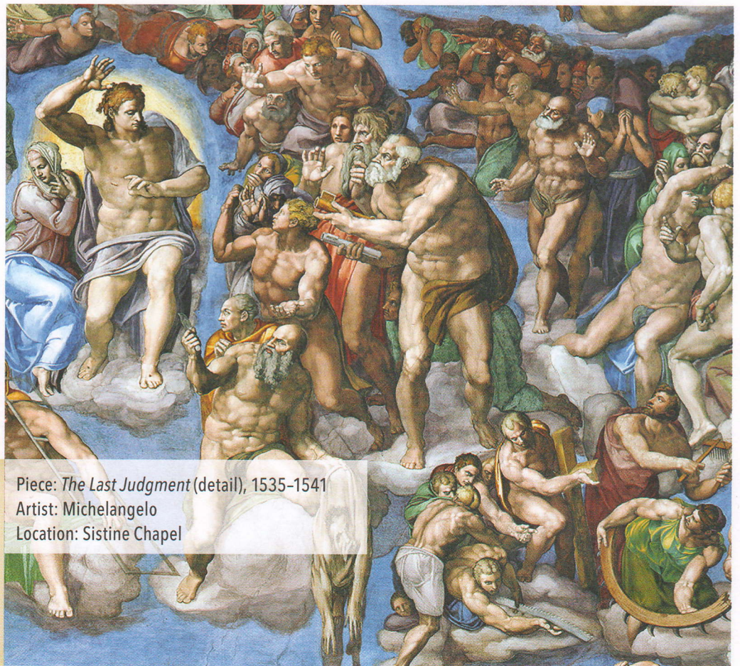
Piece: The Last Judgment (detail), 1535-1541