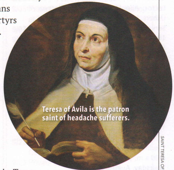
Teresa of Ávila is the patron saint of headache sufferers.

If you wish to see a searchable listing of all the patron saints, a good place to go is catholic.org/saints/patron.php . May your patron saint always watch over you and protect you!